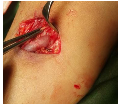
Figure 1B: Creation of anastomosis between a. brachial and v. cephalic at the antecubital fossa.