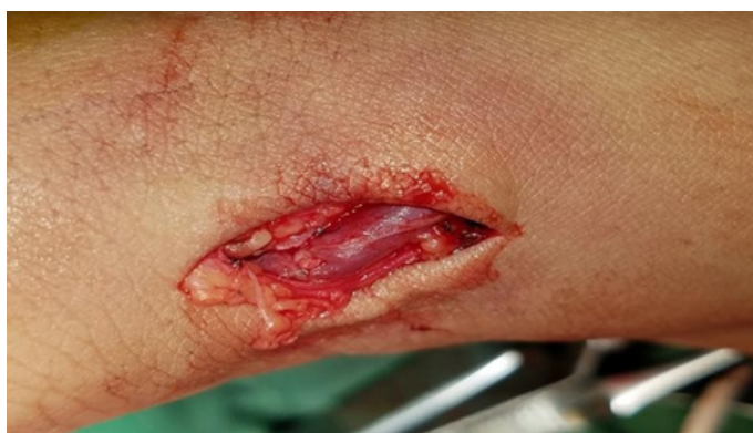
Figure 1A: Creation of anastomosis between a. radial and v. cephalic at the wrist site.

Thrombus is the most common complication of AVF operations with a rate of 3-14.5% [16,44]. In our study, thrombosis was 13% of our patient. These figures were in agreement with the literature data. The most common cause of vascular access thrombosis is venous neointimal proliferation [72]. Similar finding was found [44]. Noninfectious fluid collections (hematoma/seroma/lymphocele) were 24(10.4%) all management simply by dressing and evacuation of fluid (Figures 1A-1C).