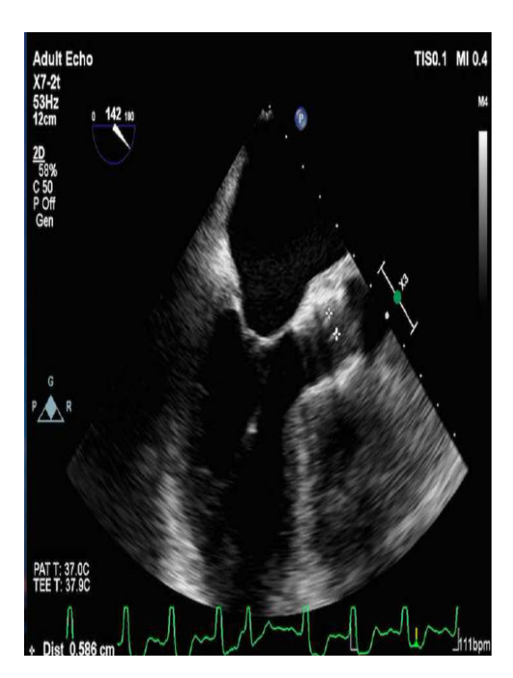
Figure 2: Transthoracic echocardiography showed reduced aortic-valve leaflet motion.