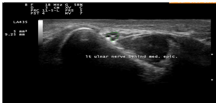
Figure 2. CSA of the Lt ulnar nerve behind the medial epicondyle (CSA max) measured by tracing method.