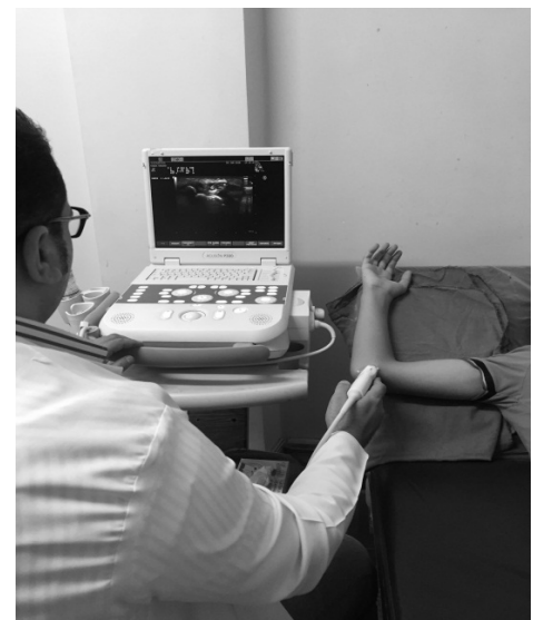
Figure 1. Positioning for ulnar nerve imaging.

Ulnar nerve upper arm and forearm swelling ratios were calculated by dividing the maximum