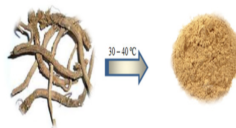
Figure 1: Preparation of S. lappa powder from roots.

Roots of S. lappa were assembled from two places of the higher altitudes in Pakistan (Kashmir and Azad Jammu). University of Azad Jammu and Kashmir, plant taxonomist department of botany was recognized this plant. The roots were dried in a circulating atmosphere oven at 30°C -40°C for 4 h. 15 gm of the dried roots were well ground using an electrical grinder (ANEX AG-694) to a fine powder. Samples were accumulated in bottles in the freezer at 5°C until examined, for further studies (Figure 1).