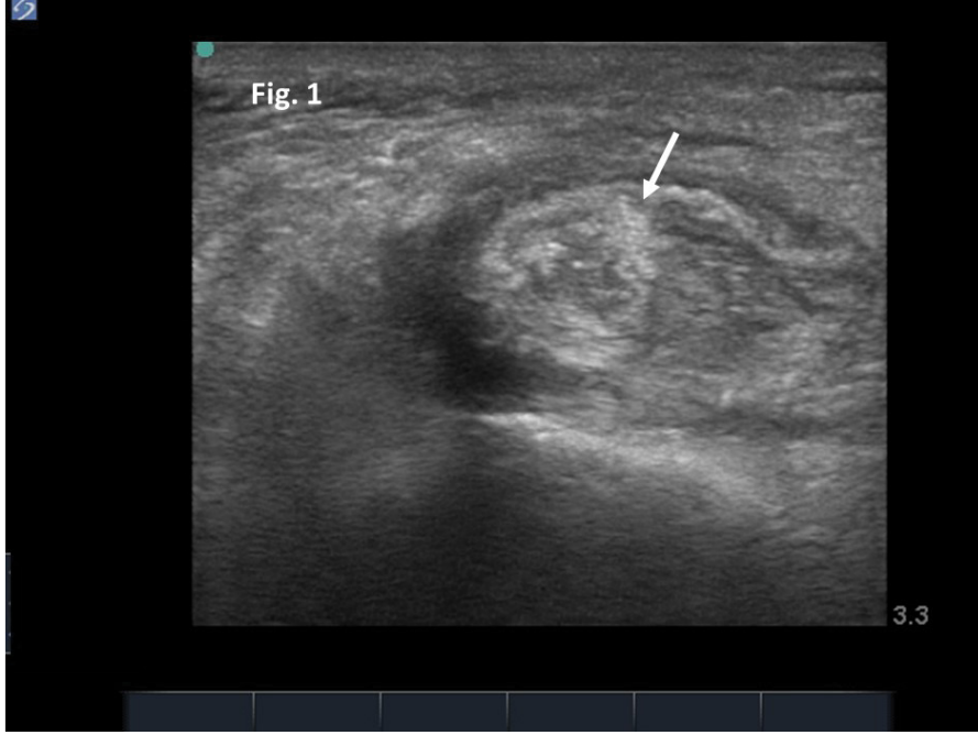
Figure 1. Anterior subdeltoid region, longitudinal view: Pannus of subdeltoid bursa (arrow).

part of them. Here there is first illustration. Medical sister 59 years old got second vaccine and 4 days later felt severe shoulder pain, swelling and limitation of motion. After first vaccination, there was only minor shoulder pain of the same side. Focus of injection (lateral shoulder) was not tender or red but a forward part of humeral head became swollen and painful. US showed pannus of