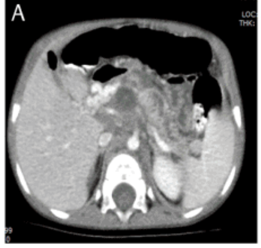
FIGURE 1. Stamped expanded pancreatic channel and provincial liquid assortment B. Performed altered Puestow procedure. Constant backsliding (RP) pancreatitis is uncommon in youth yet can have genuine outcomes. RP drives fibrosis which makes dynamic endocrine and exocrine brokenness of pancreas. The fundamental pathologies can be inherited pancreatitis, post awful stenosis and innate formative peculiarities, for example, pancreatic divisum, pancreaticobiliary pipe oddities. A suitable ductal waste system is essential for alleviation of indications [1-4].

Open Access Publishers, 40 Bloomsbury Way, Lower Ground Floor, United Kingdom