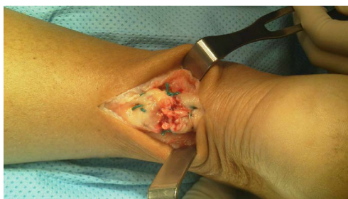
Figure 1(b). Ruptured Achilles tendon post-surgical repair.

cases where the tissue retains sufficient quality for suture repair.