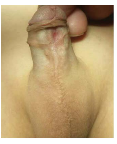
Figure 1: congenital uretrocutaneous fistula of our patient.

A 6-year-old boy presented with a fistula located on ventral penile urethra since birth. He was passing urine mostly through the external urethral meatus and also from this fistula. He was the only child born out of nonconsanguinous marriage. The antenatal period was uneventful. There was no history of trauma or surgical intervention. On examination, a 4 × 3 mm fistula was noted at the subcoronal level (Figure 1). The urethra distal to the fistula was normal with intact prepuce and glan with mild chordee and left undescended testicle (Figure 2). The external urethral meatus was situated normally at the tip. The stretched penile length and diameter were normal for his age. The boy was operated under general anesthesia and fistula was identified at the level of subcoronal (Figure 3). It was calibrated with 8 Fr catheter passing down to the urinary bladder easily. The fistula was repaired with local tissue flap and