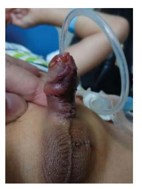
Figure 4: Postoperative image of congenital uretrocutaneous fistula of our patient with external urethral meatus being catheterized, 9th post-operative day.

Dartos fascia and skin were closed over it. The catheter was removed on 9th post-operative day (Figure 4). Fistula recurred in this patient but resolved spontaneously after dilatations for 10 times within 3 months.