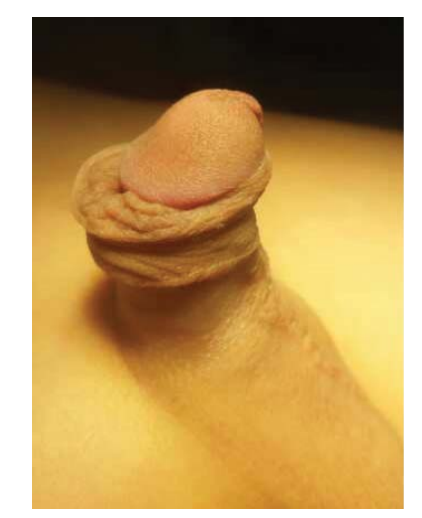
Figure 2: congenital uretrocutaneous fistula of our patient with mild chordee.