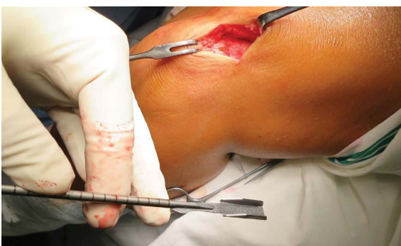
Figure 3. The instrument for harvest of the quadriceps graft.

For the DB technique, the skin incision of 5 cm in length was performed on the anteromedial part of the proximal tibia above the anterior board of the pes anserinus. The tendons of gracilis and semitendinosus muscles were identified, separated and harvested with the tendon stripper. For the single-bundle reconstruction, the graft was harvested from the quadriceps tendon and the upper part of the patella through the transverse 4 cm skin incision. The special instrumentation was used to separate the tendinous part of the graft from the muscle tendon (Figure 3). The bone-tendon graft was 9 cm long and 9 mm wide. For the ALL reconstruction, the gracilis muscle tendon was harvested. This graft was then folded to be 10 cm long and 6 mm wide. Graft taken from the semitendinosus muscle was used for the anteromedial (AM) bundle reconstruction and the gracilis tendon was used for the posterolateral (PL) bundle. The grafts were adjusted to match the size of 9 cm × 8 mm for the AM bundle and 8 cm × 6 mm for the PL one. Both grafts were folded three times.