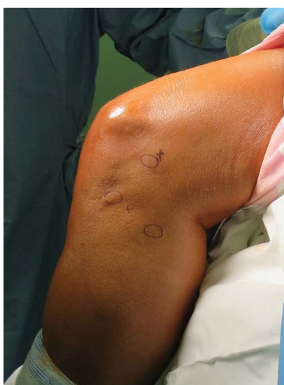
Figure 1. Anatomic landmarks for the ALL reconstruction on the skin: lateral epicondyle of the femur, head of the fibula, and Gerdy's tubercle.

The biomechanical function of the ALL is still in the process of being analysed. There are cadaveric studies describing the role of this structure for the anterior-posterior and rotational stability of the knee [13,19,20]. The main role of the ALL is to prevent the