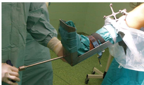
Figure 4. Iron boot attached with rollimeter used for the development of the constant torque force.

for the external rotation (ER). The value of the range of rotation in degrees shown by the navigation device was recorded. Each measurement was repeated three times by the same senior orthopaedic surgeon. Then followed ACL replacement and its fixation with interference screws. In the DB reconstruction the tonisation of the AM bundle was carried out using the dynamometer set to 85 N in 45° flexed knee joint. The PL bundle was tensioned in 10° of flexion with the same force applied. In the single-bundle replacement, the graft was tensioned also by 85 N, but in 30° flexion. After fixation of the graft, the same data as in ACL-deficient condition were collected three times from the navigation device, again with the forces of 2.5 Nm applied in 30° flexion. The same was done after the tensioning and fixation of the ALL in the graft.