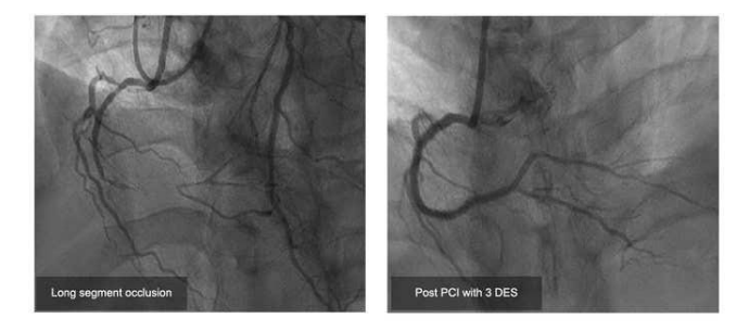
Figure 2: Pre and post CHIP: First image shows long stem occlusion while second is status post PCI with 3 DES.

collateral from the left system up to the crux of RCA. He was referred to our Institute after an unsuccessful attempt to open CTO in the same hospital. PCI to RCA CTO via radial approach was planned. A 7F GSS was inserted via RRA, and a 6F sheath was inserted in the left radial artery. A 7F JR 3.5 guiding catheter was used to intubate RCA, and a 6F EBU 3.5 guide catheter was used to intubate left main coronary artery (LMCA) for retrograde injection. Bilateral injection showed a long CTO segment (>20 mm) with a JCTO (the Japanese-CTO) score of 2. Antegrade wire escalation technique was used with corsair microcatheter support. Gaia I wire crossed the occlusion and was parked in the distal vessel. After pre-dilation with a 2.5 × 15 mm balloon, 2 long stents (2 × 30 mm Resolute Onyx<sup>™</sup> and 2.5 × 38 mm Resolute Onyx<sup>™</sup> ) were deployed from distal to proximal segment, and a 3.5 \times 15 mm Xience Xpedition<sup>™</sup> (Abbott Vascular, Santa Clara, CA, USA) DES was deployed at the proximal RCA with good final result (Figure 2). The patient was discharged in 24 hours and recovered well during 1-month follow-up.