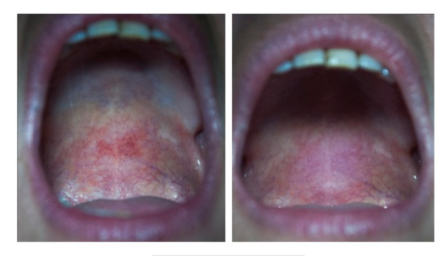
Figure 3. Oral optical biopsy