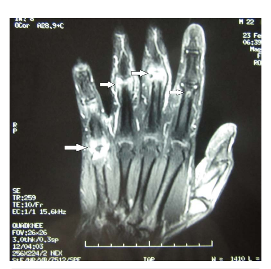
Figure 4. MRI of the hands showed synovitis at the 5<sup>th</sup> finger metacarpophalangeal and proximal interphalangeal sites at the 2.3 and 4<sup>th</sup> fingers. There was also a bone edema of all the proximal interphaplangiennes and the metacarpophalangeal of the 5thfinger. The tendons are of signal and morphology preserved.