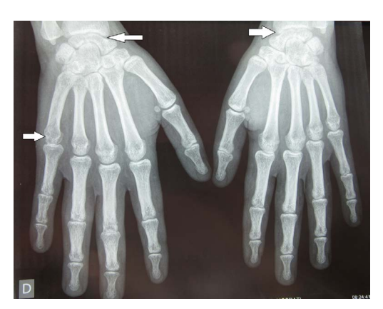
Figure 5. The hands x-ray showed bilateral radio-carpian and inter-carpian pinching and two geodes in the fifth right metacapophalangian.

showed bilateral radio-carpian and intercarpian narrowing and two geodes in the fifth right metacapo-phalangian (FIGURE 5). The patient was treated with methotrexate at a dose of 15 mg/week, but, he still complaining with many synovitis and high disease activity. So, a biological treatment with anti-TNF alpha is recommended.