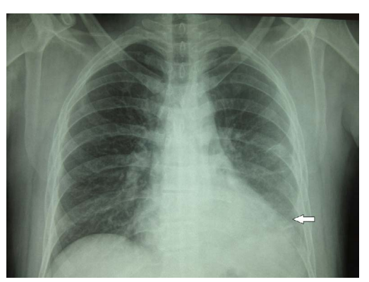
Figure 1. The chest X-Ray showed a left pleurisy.

and the card test were negative. Viral serology (hepatitis B and C) was negative, anti EBV was positive to IgM and IgG, anti CMV was positive to IgG and parvovirus serology was negative. Tuberculosis explorations were all negative. The hands X-Ray didn't show any RA specific signs. The chest X-Ray showed a left pleurisy (FIGURE 1). The CT scan showed multiple axillar and mediastinal lymphadenopathies, hepato-splenomegaly (FIGURE 2) with multiple coelio-mesenteric and retroperitoneal lymph nodes (FIGURE 3). The pleural biopsy as well as the biopsy of the adenopathy and the salivary glands didn't show any specific abnormalities or signs of lymphoma. The hepatic biopsy revealed an inflammatory lymphohistiocytic infiltrate with rare foci of necrosis and a dilatation of the hepatic sinusoids. After eliminating malignant haemopathy essentially lymphoma, connective tissue disease, chronic tuberculosis and viral infection, the diagnosis of RA was suspected. The MRI of the hands was practiced and showed evident synovitis of the fingers with bone edema of the phalanges (FIGURE 4). The patient was diagnosed with RA basing on ACR 1987/EULAR 2010, Rheumatoid Arthritis