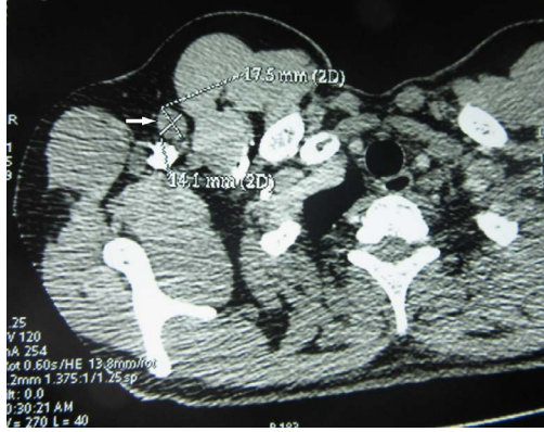
Figure 3. The CT scan showed multiple coeliomesenteric and retroperitoneal gonglia.

Classification Criteria [10,11] and was treated with corticosteroids at a dose of 1 mg/Kg. The evolution was marked by the absence of fever in two days, the regression of the inflammatory biological syndrome, the disappearance of cytolysis, the reduction of cholestasis and the improvement of synovitis. After six months, we obtained a normalization of the hematologic and liver balance (TABLE 1), the regression of the tumor syndrome and the disappearance of the pleurisy in the CT-scan. The hands X-Ray