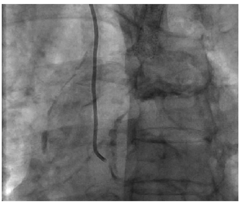
FIGURE 2. Fluoroscopy showing porcelain aorta.

the right axillary artery for mechanical support. The femoral arteries were not accessed due to the concern of loss of flow in the left AFB in the context of acute thrombotic occlusion of the right AFB. Under conscious sedation, the right axillary and radial arteries were accessed under ultrasound guidance, with preclosure of the puncture site with Perclose ProGlide devices. After the Impella sheath was advanced, there was the loss of arterial waveform on the 4 Fr radial sheath. The side port of the Impella sheath was connected to the side port of the radial sheath via an extension tubing, thereby maintaining perfusion of the right hand. Thereafter, single access was used to insert a 7 Fr sheath into the Impella sheath. Rotational