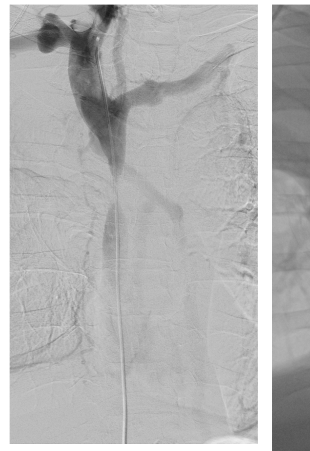
Figure 3. Same patient. Pre interventional cavagram demonstrates superior vena cava compression with severe stenosis (thin arrow). Dilated azygos vein with increased collateral flow (thick arrow).

only one of these and in the SVC as stenting of both brachiocephalic veins may result in higher complication rates and lower survival [9,10]. If possible, stents are deployed so the obstruction is covered and there is at least 1 cm of diseasefree vessel at both ends [1] (FIGURES 6 and 7).