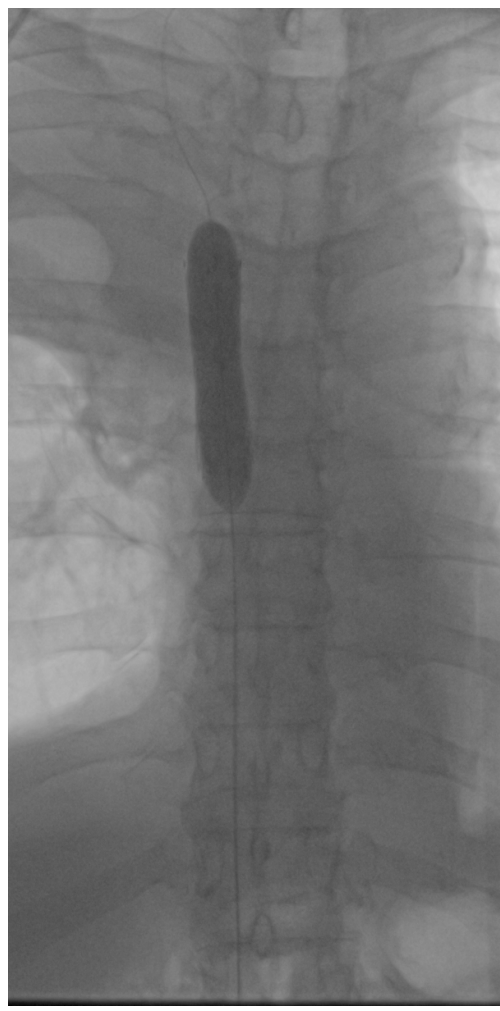
Figure 4. Same patient. Balloon dilatation after stenting with 16mm x 60mm nitinol stent.

Nitinol stents are recommended, as opposed to stainless steel stents, because recurrence of SVC syndrome has been found to significantly