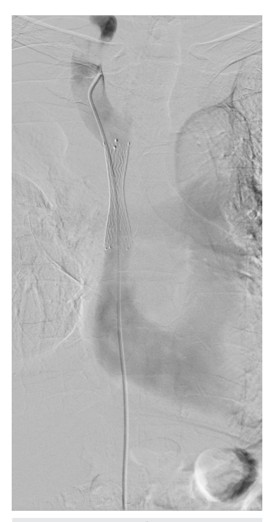
Figure 5. Same patient. After stent implantation and post stent balloon dilatation with no azygos flow. The stent was fully expanded with the balloon, but a residual stenosis about 50% after dilatation because of recoil. There was complete symptomatic relief within the first 24 hours after stenting.