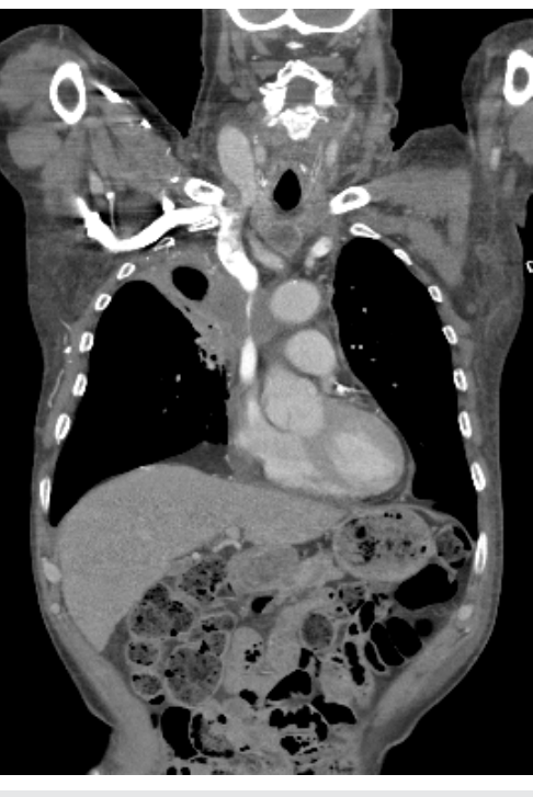
Figure 2. Same patient, coronal reconstruction. Curly bracket demonstrates superior vena cava compression.

cavagram is performed prior to the intervention to define the landing zone for the stent proximally and distally (FIGURE 3) as well as after stent deployment (FIGURES 4 and 5). If the obstruction involves both brachiocephalic veins, it is recommended to place stents in