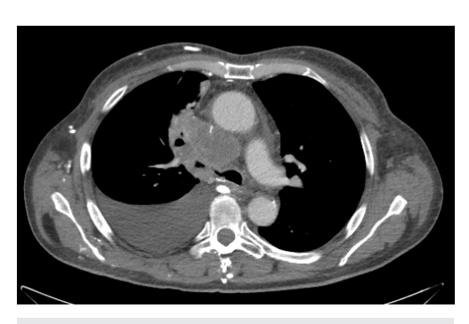
Figure 1. Patient with disseminated small cell lung cancer. Superior vena cava syndrome after maximal adjunct chemotherapy and radiotherapy and corticosteroid treatment. Compressed superior vena cava (arrow)

Venous access is gained under local analgesia, typically through the right femoral vein, and alternatively through the left femoral vein or through either of the internal jugular veins. Stenotic lesions are crossed with a 5F catheter over a hydrophilic guide wire. A superior vena