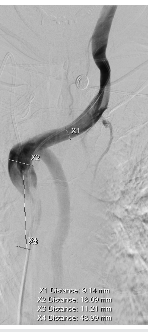
Figure 6. Another patient with severely stenosed superior vena cava and dilated azygos vein (arrows) with collateral flow.

The clinical outcome with relief of SVC symptoms within the first 48 hours and no associated complications is more than 90%