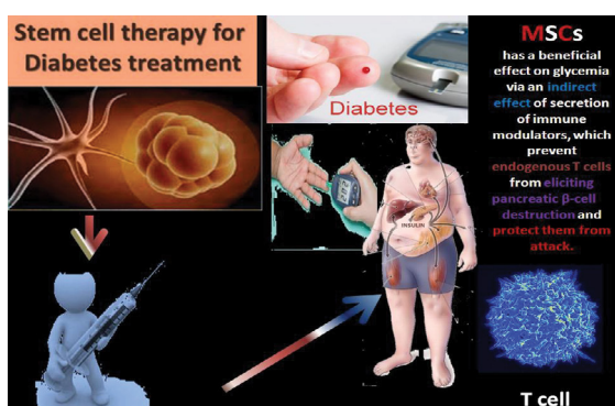
Stem cell therapy for diabetes treatment