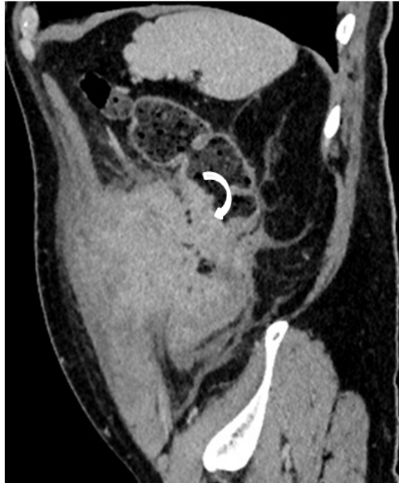
Figure 1. Sagittal CT image showing invasion of the descending colon causing stenosis (curved arrow).