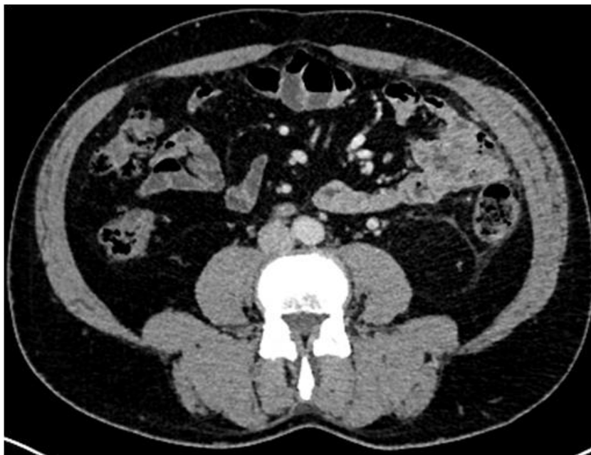
Figure 3. Disappearance of the peritoneal mass and invasion of the abdominal wall and descending colon.

In case of colonic involvement, the colonoscopy is not very contributive for the positive diagnosis as the disease has an extra-mucosal origin [3]. CT scan of patients with abdominopelvic actinomycosis is useful to suggest the diagnosis and to determinate the anatomic location of this disease. It is also helpful for monitoring the effectiveness of treatment and for follow-up.