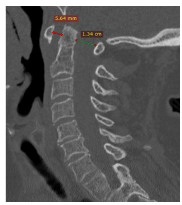
Figure 2. CT scan of the cervical spine with sagittal multiplanar reconstruction. Atlanto-dental distances: anterior atlanto-dental interval, red line is 5.64 mm (normal <3 mm) indicating atlo-axial early instability and implying transverse ligament damage. Posterior atlanto-dental interval (PADI), green line is 1,34 cm. PADI <1,4 cm is a sensitive method of predicting cord compression.