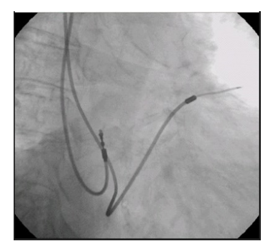
Figure 2: LV DDD in patient right ventricular pacing group.

Mitral flow velocity was assessed from a standard apical 4-chamber view by placing a 3 mm sample volume adjacent to the tip of the mitral leaflets in diastole, as shown in Figure 2.