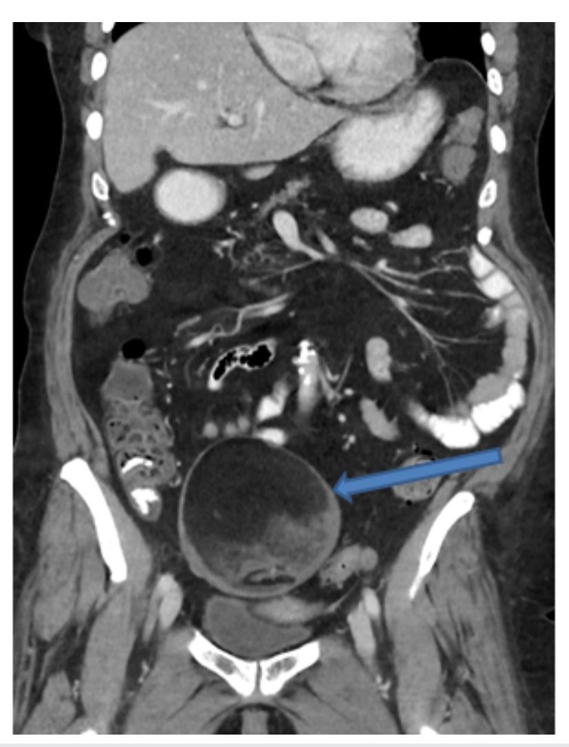
Figure 1. CT Abdomen and pelvis demonstrates a well defined large mass with internal fatty components (hypodense area denoted by arrow) arising from the right ovary consistent with mature cystic teratoma given large fatty components.