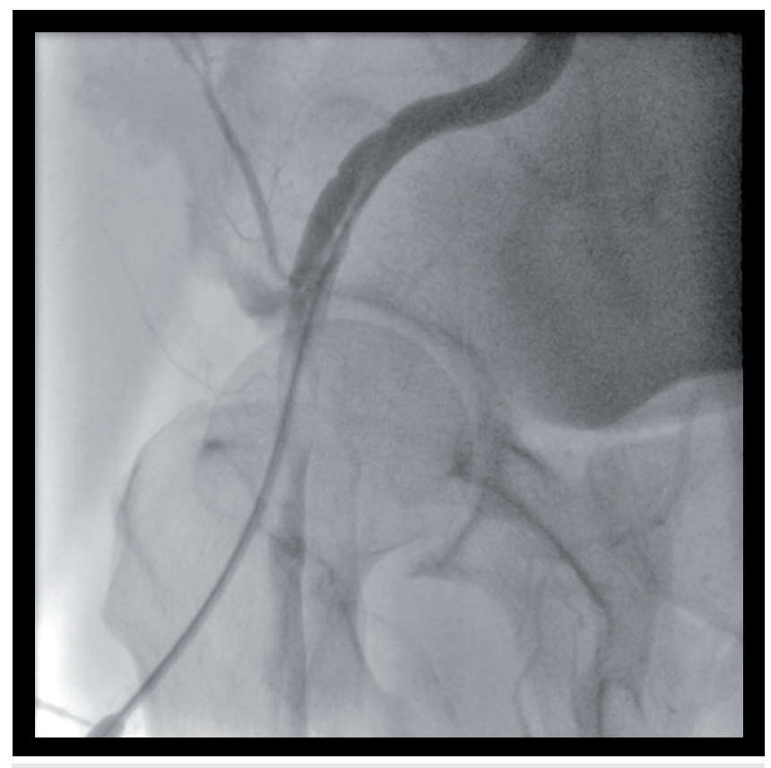
Figure 3. Right external iliac artery dissection extending distally into the common femoral artery, probably caused by the sheath or the guide catheter advanced at the site of a vascular tortuosity.

puncture site is below the bifurcation because the pressure is applied primarily against soft tissue rather than the bone of the femoral head in this situation [2,6]. Above the inguinal ligament, the artery resides in the retroperitoneal space making compression and hemostasis difficult. Female sex and preprocedural GP IIb/IIIa inhibitors had an odds ratio over 2 for being independent predictors of retroperitoneal hemorrhage. The use of bivalirudin was associated with a lower risk of the development of a retroperitoneal hemorrhage [26]. A high or low femoral arterial puncture, multiple puncture attempts and prolonged clotting times can increase the risk of AV fistula formation. The risk factors for lower extremity ischemia include the use of larger catheters or sheaths in relatively smaller arteries, peripheral vascular disease, older age, cardiomyopathy, hypercoagulable states and vessel dissection [9].