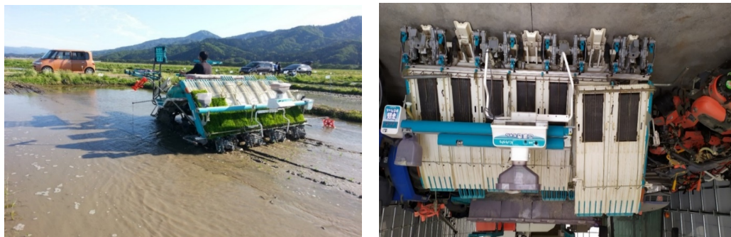
Figure 1: Self-propelled (Kubota NSU-87) transplanter.

efficiency, allowing farmers to quickly transplant large areas of rice paddies. It has a 30 cm row spacing and 2.4 m width (Figure 1).