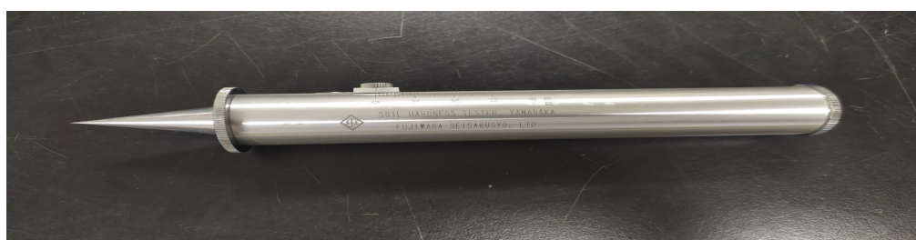
Figure 3: Soil hardness tester.

It is essential to ensure the soil hardness is optimal for the best performance of the transplanting machine and overall fieldwork efficiency. Soil hardness is an indicator of the soil's compaction status; large pores are necessary for water and air movement to allow roots and organisms to explore the soil. A soil hardness tester is an important instrument that measures the soil's resistance to penetration. This instrument consists of two units such as pressure (kg/cm 2 ) and depth measuring (mm). It was measured the soil hardness depth (mm) and pressure (kg/cm 2 ) of the experimental field before and after puddling by a soil hardness tester (Figure 3).