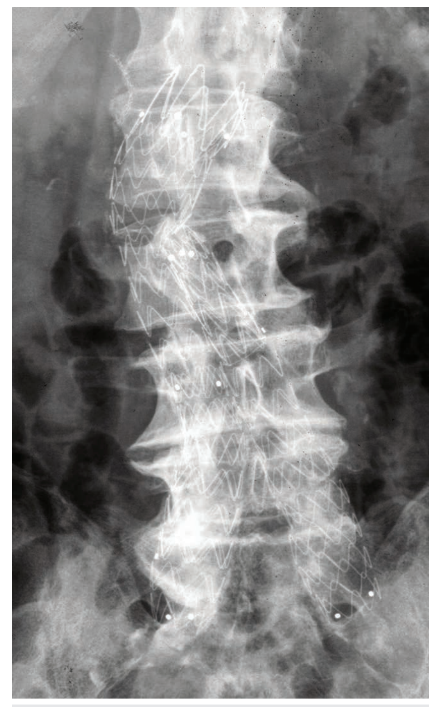
Figure 1. Endurant® stent graft: radiopaque markers.

The suprarenal stent is laser cut with anchoring pins near the proximal end as a