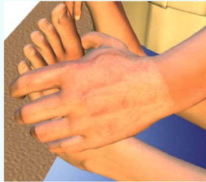
Figure 1. The squeeze test of forefeet.

All the abovementioned indices, used to assess disease activity in RA, have some shortcomings. DAS includes four variables and it requires complex calculations, such as square root and logarithm. Furthermore, DAS, SDAI and CDAI do not include patient functional status, such as the Health Assessment Questionnaire (HAQ), which is the best predictor of most severe long-term outcomes of RA [47,48]. These considerations led us to develop a disease activity index based on four core set components of the