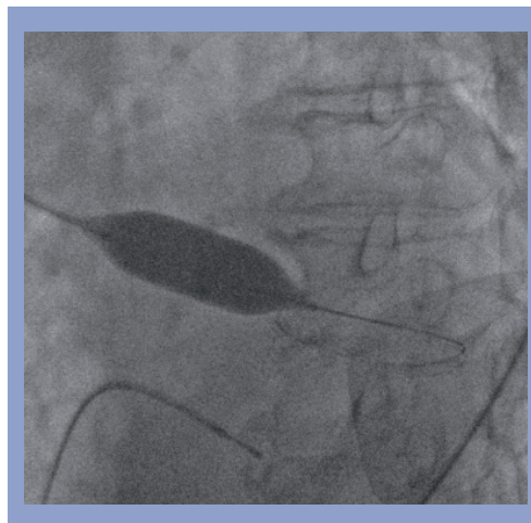
Figure 3. Complete balloon inflation. The balloon is completely inflated with resultant dilatation of the valve.

Severe AS patients are particularly prone to vascular complications: they are often elderly, large caliber sheaths are used, they may have peripheral vascular disease, and they have an acquired coagulopathy (von Willebrand Syndrome type 2A) [36]. In addition, the required postprocedure immobility can be difficult due to orthopnoea, confusion or arthritis. Percutaneous arterial suture closure devices can now be used to close femoral arteriotomies post BAV, achieving rapid hemostasis and shorter bed rest times [37]. Recent trials using these techniques have reported decreased vascular complications: out of 75 BAV patients, using arterial closure devices in 71% of them, vascular bleeding occurred in only 1.3% of patients and urgent vascular surgery was required in only 4% [29].