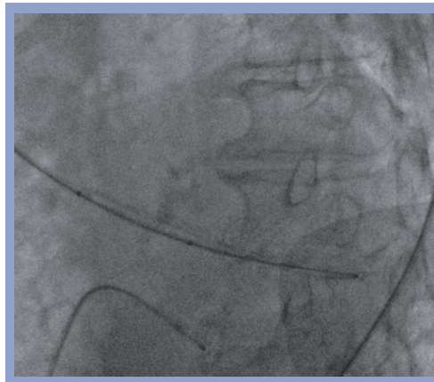
Figure 1. Balloon positioning. Using fluoroscopy the balloon is positioned across the valve. Note the temporary pacing wire and the calcification of the aortic valve.

The anterograde approach is technically more challenging as it involves a transeptal puncture. From a femoral venous puncture, via a transeptal puncture, the guide wire is passed from the left atrium across the mitral valve, looped in the LV apex and through the aortic valve. A balloon is then advanced over a wire from the femoral vein across the aortic valve, which it then dilates [32,33].