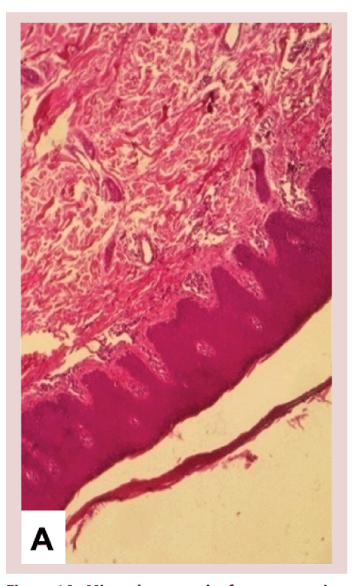
Figure 1A. Microphotograph of a noncaseating epithelioid giant cell granuloma in ganglia (H&E stain 250 X).

As a result, we could confirm the diagnosis of sarcoidosis with joints, pulmonary and ocular involvement associated to psoriasis vulgaris, which has been mistaken for psoriatic arthritis.