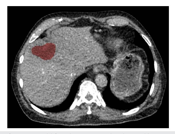
Figure 3. DCE-CT scan of a 78-year-old female patient with colorectal liver metastases. The perfusion values were measured by the 3D VOI method, encompassing the entire volume of the metastases (displayed by the red area).

The monoclonal antibody against Ki67 (clone MIB-1, Dako) was diluted to 0.92 µg/mL and was added first. The signal was developed with a diaminobenzidine chromogen. The second primary antibody against CD31 (clone JC70A, Dako) was diluted to 1.03 µg/mL and was visualized with Permanent Red. The slides were scanned in a Hamamatsu slide scanner (NanoZoomer 2.0-HT, Hamamatsu City, Japan) and were imported in the VisiomorphDP (Visiopharm, Hørsholm, Denmark) in order to be analysed using a vessel app [5]. Five ROIs were drawn at the tumour periphery of every tissue slide, and the microvessel density value for each metastasis was an average of the micro vessel density values within five squares. Each square