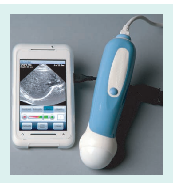
Figure 2. MobiUS SP1.

The MobiUS SP1 US system is newer than the Vscan and gained US FDA approval in 2011, becoming the