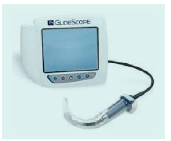
Figure 4. GlideScope.

Innovations in the monitoring of blood glucose for diabetic patients can benefit both patients and physicians. For patients, continuous glucose monitoring (GCM) allows them to see trends in their blood glucose and what triggers spikes so they can better manage their diabetes. GCM can also be used to communicate readings with physicians to allow them to better manage their patients. In critically ill patients in the emergency department or intensive care unit, glucose control is very important in their management. Critically ill patients often have hyperglycemia, which can be associ-