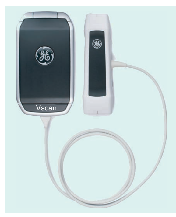
Figure 1. Vscan.

timely manner when compared with waiting for laboratory results to come back. Physicians benefit from being able to deliver care in a more efficient manner. This results in better patient flow, which is especially important in an emergency room setting. In addition, bedside diagnostics decrease the amount of potentially unstable patients that have to be moved in order to receive imaging tests.