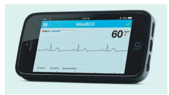
Figure 3. AliveCor Heart Monitor.

first smartphone-based US system (Figure 2). The device is a Windows Mobile 6.5-based Toshiba TG01 smartphone and requires a USB 2.0 port for the probe [24,25]. In contrast with the Vscan, MobiUS has both cellular and wireless connectivity. This allows images to be sent over these networks for diagnosis, second opinion, etc. The device also runs for less than US$10,000, which keeps it affordable and is still much less than traditional US systems [24].