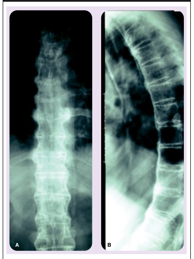
Figure 2. Changes typically seen in the spine in psoriatic arthritis.

Examples of marginal, nonmarginal syndesmophytes are seen, together with paravertebral ossification. Spondylitis may occur in the absence of sacroiliitis in psoriatic arthritis. Reproduced with permission from [39].